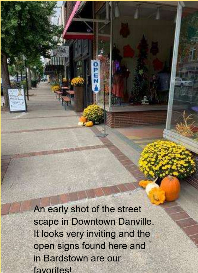
An early shot of the street scape in Downtown Danville. It looks very inviting and the open signs found here and in Bardstown are our favorites!