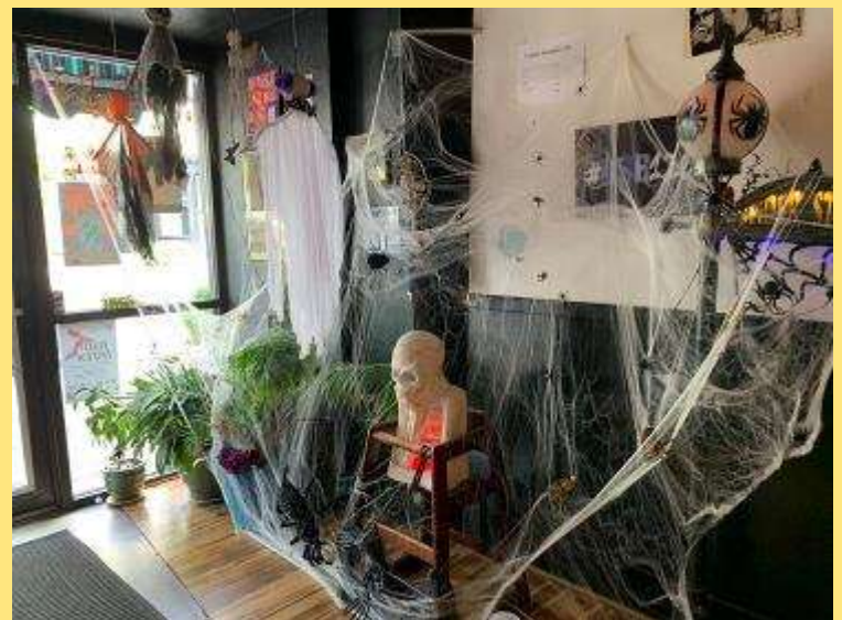
The businesses in Danville are scaring up a little Halloween fun!