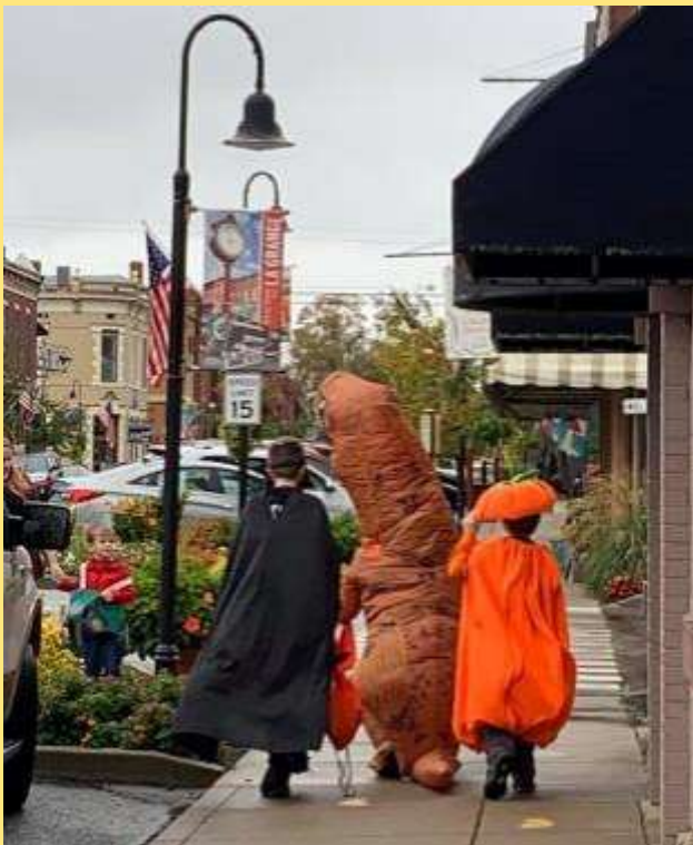
Meanwhile in downtown LaGrange.....